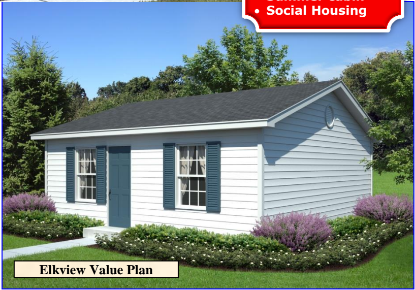
Elkview Value Plan