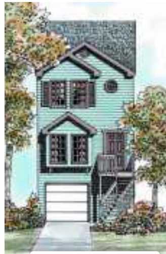
16' Townhouse (Front Garage)